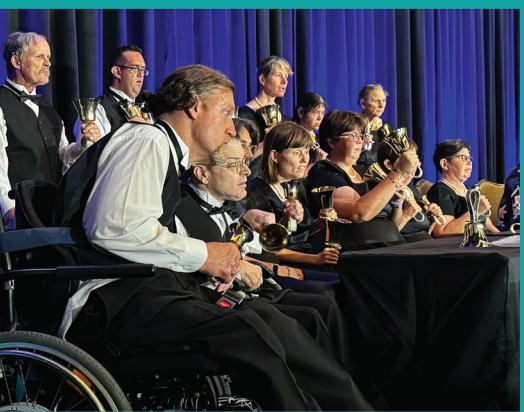
The Brookwood Handbell Ensemble